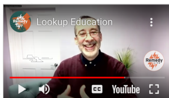
The New Mental Health Shift in the Church (Jan. 2023) – Live interactive webinar event by Remedy Live + Lutheran Foundation.